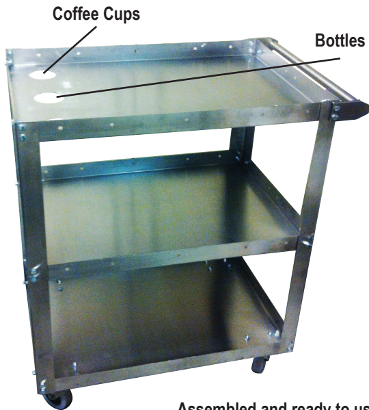
Assembled and ready to use