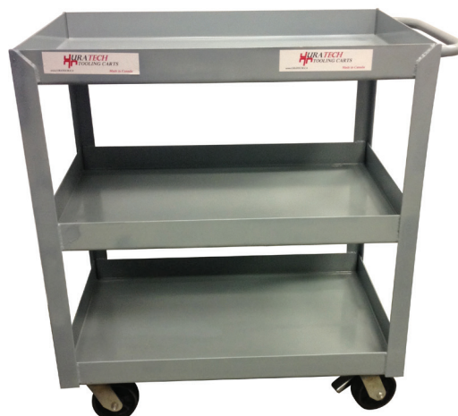
Welded Cart and ready to use