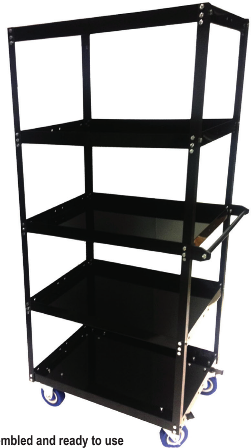
Assembled and ready to use