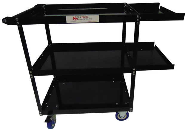
Assembled and ready to use