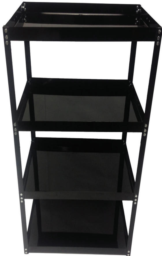
Assembled and ready to use